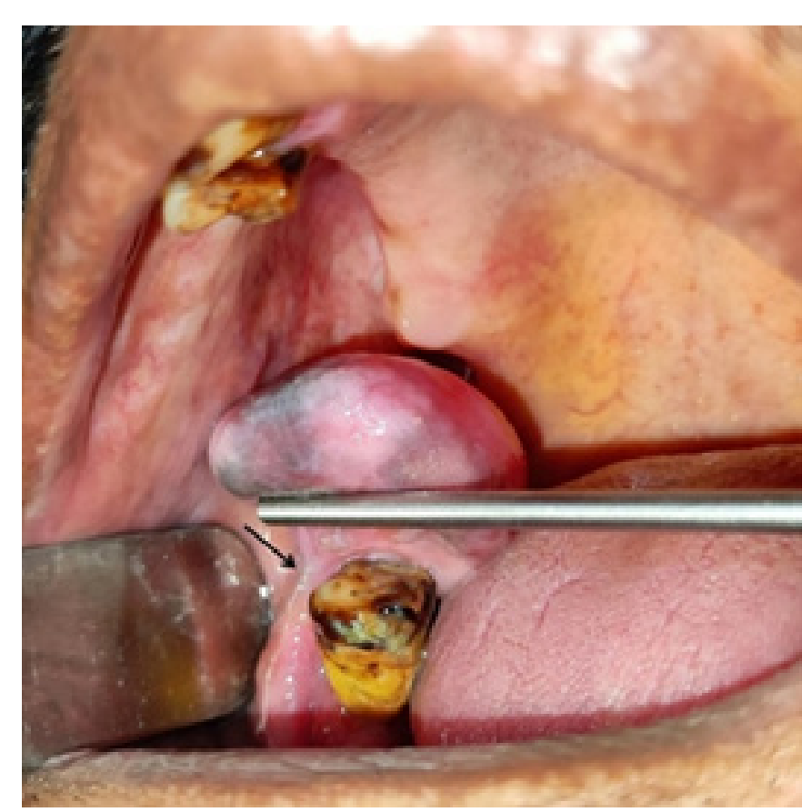
\textbf{Fig. 2:} \ \, \textbf{Intraoral mass arising from the buccal mucosa through a thin peduncle (Black arrow)}