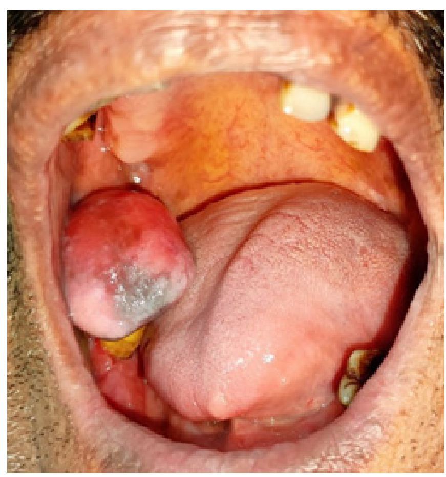
Fig. 1: Smooth surface, pink coloured mass inside the oral cavity adjacent to the tongue