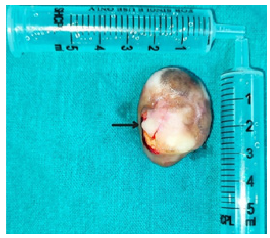
Fig. 3: Intraoral mass after surgical excision (3.2 * 2.2 cm). Black arrow shows the cut-end of the peduncle.